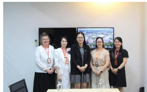
Representative of University of Tasmania visiting Pegasus International College.