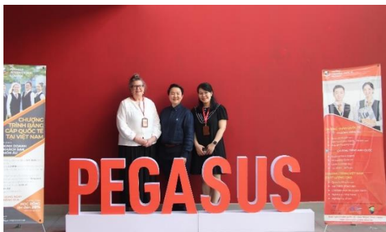
Representative of Le Cordon Blue visiting Pegasus International College.

Since Pegasus International College provides Australian programmes from Certificate II to Advanced Diploma in Hospitality Management, Pegasus' students can easily articulate to any university in Australia to pursue a higher education pathway.